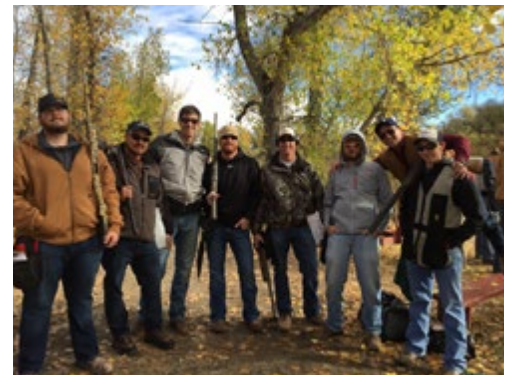
A group of students and industry members pose between shots at the annual CM Clay Shoot