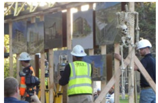
Left and above: Various shots of the 2015 CM float in the Homecoming Parade on October 16. This year’s entry included a nod to Halloween (above).

Advancing the knowledge and practice of construction management for the betterment of society through teaching, applied research, and service to local, national, and global communities.